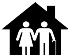
Aged Care Facilities